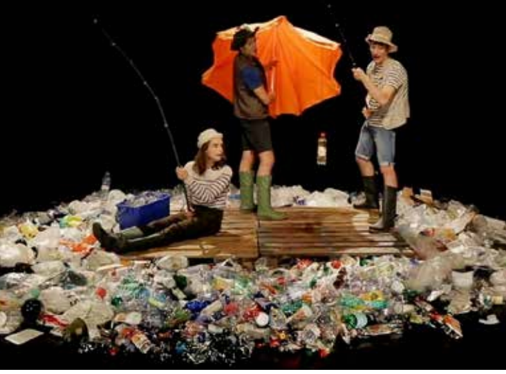
A 'behind the scenes' snapshot of an artistic performance on sustainability by Accademia Teatro Dimitri